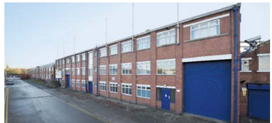
Cartmel Road Elevation

The buildings can be combined into larger areas if required - see plan.